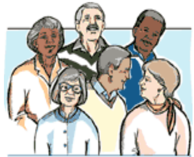
SENIORS IN THE NEWS