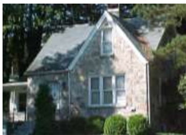
Sutton/Ulrich Cottage, Mahaffey Camp and Conference Center, Mahaffey, PA