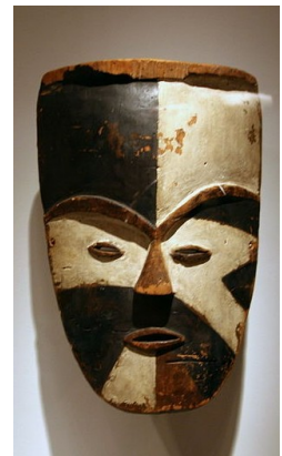
Mask used in traditional ceremonies; marriage, birth, funeral