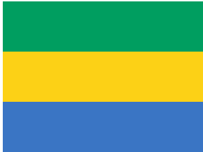
Flag of Gabon