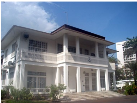
U.S. Embassy, Libreville