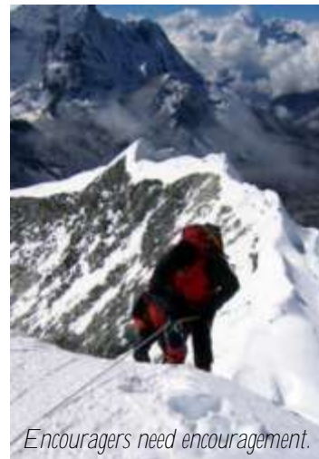
Encouragers need encouragement.

If this is not your spiritual gift, you may need to work a bit harder in order to be intentional about encouraging the